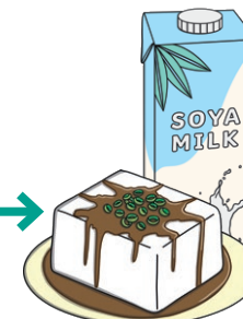
soya milk and tofu