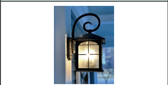
workplaces being lit up through the night