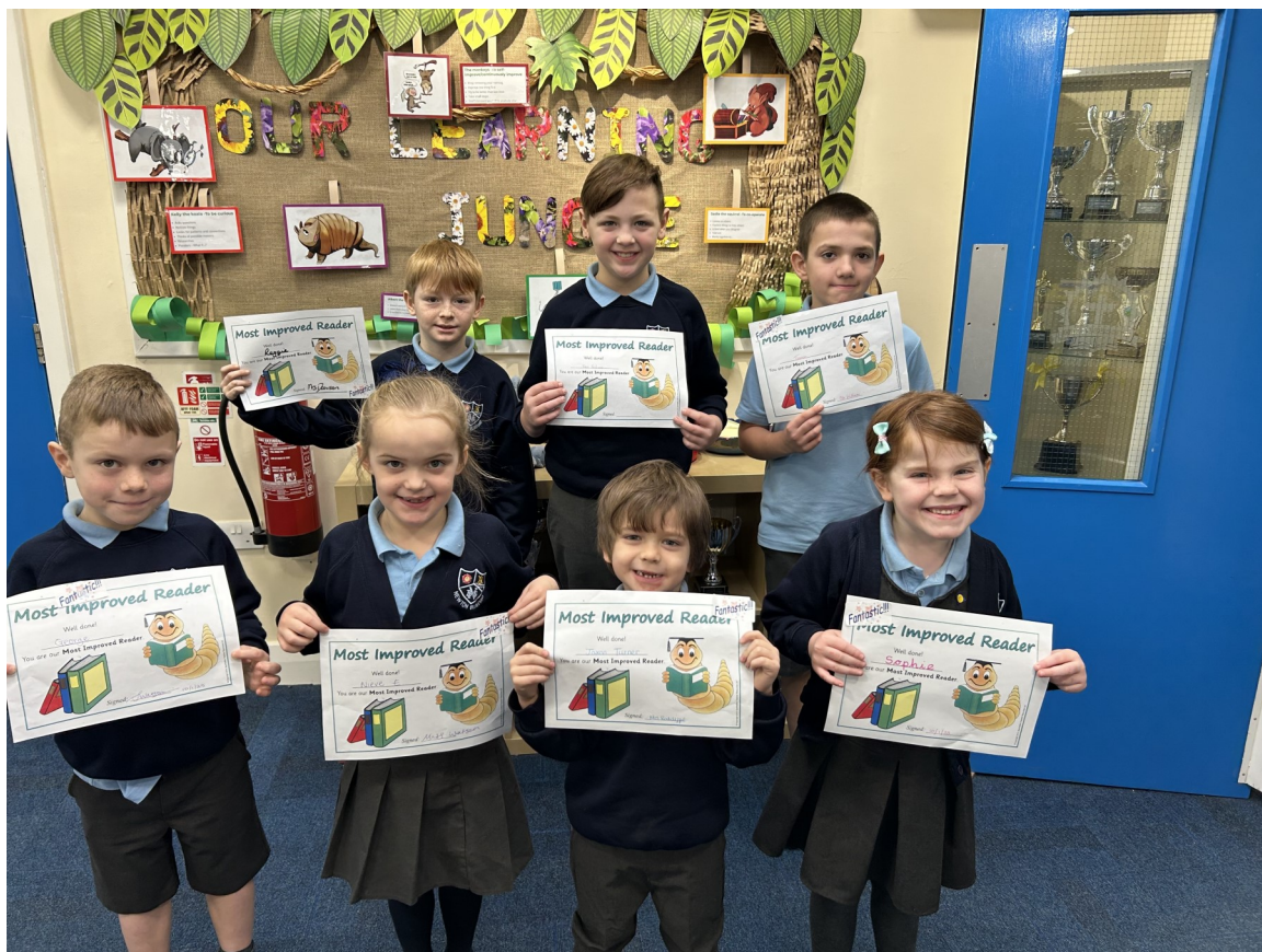
Most Improved Reader